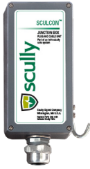
Sculcon Junction Box