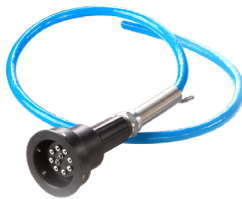
Poly Plug & Cable Assemblies